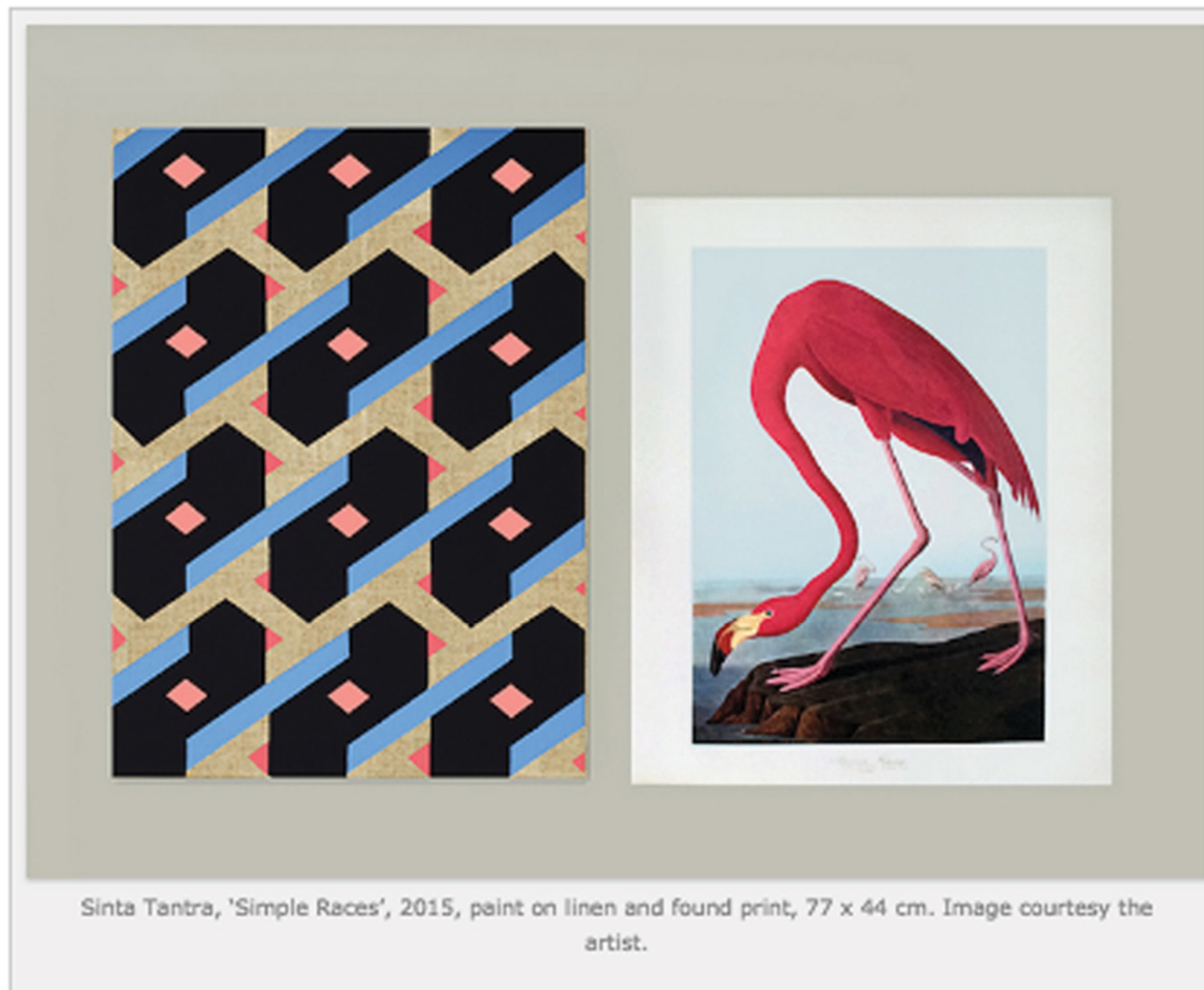
Sinta Tantra, 'Simple Races', 2015, paint on linen and found print, 77 x 44 cm.