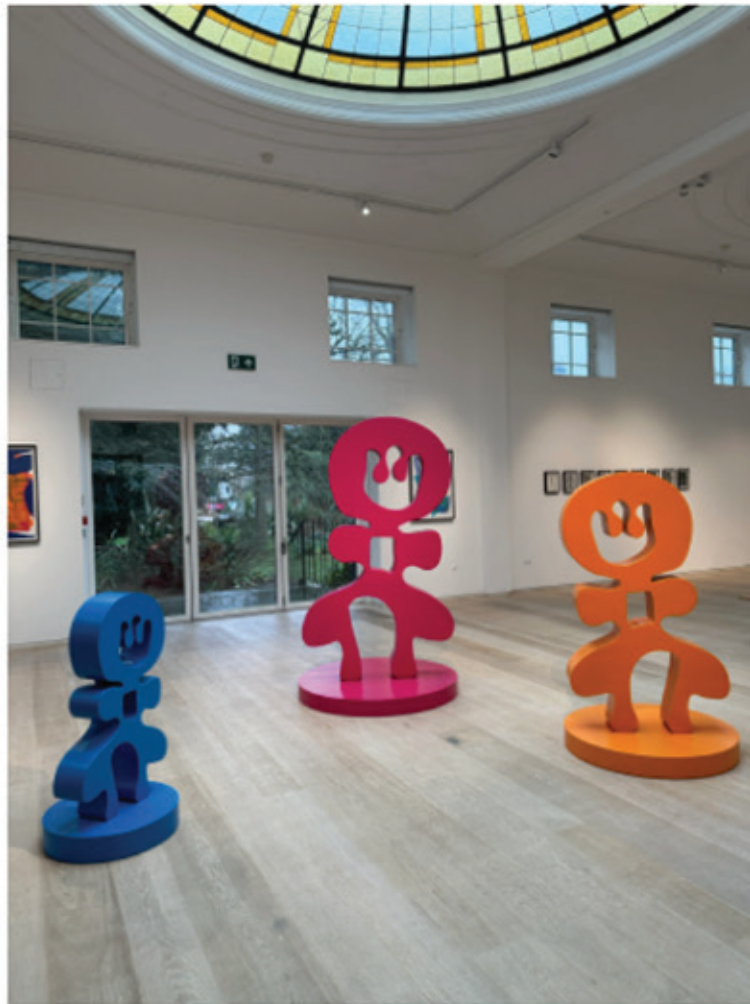
Alice Irwin: Chinwag

The gorgeous Art Deco gallery space, which used to be Ealing public library, is playing host to the bright colourful prints, sculptures and drawings of Alice Irwin . On a dull wet day between two storms, Isha and Jocelyn, Irwin's work lights up the space with oranges, pinks and blues. The striking sculptures feel like families who have just wandered in from the park, caught between movements, frozen in contemplation of action.