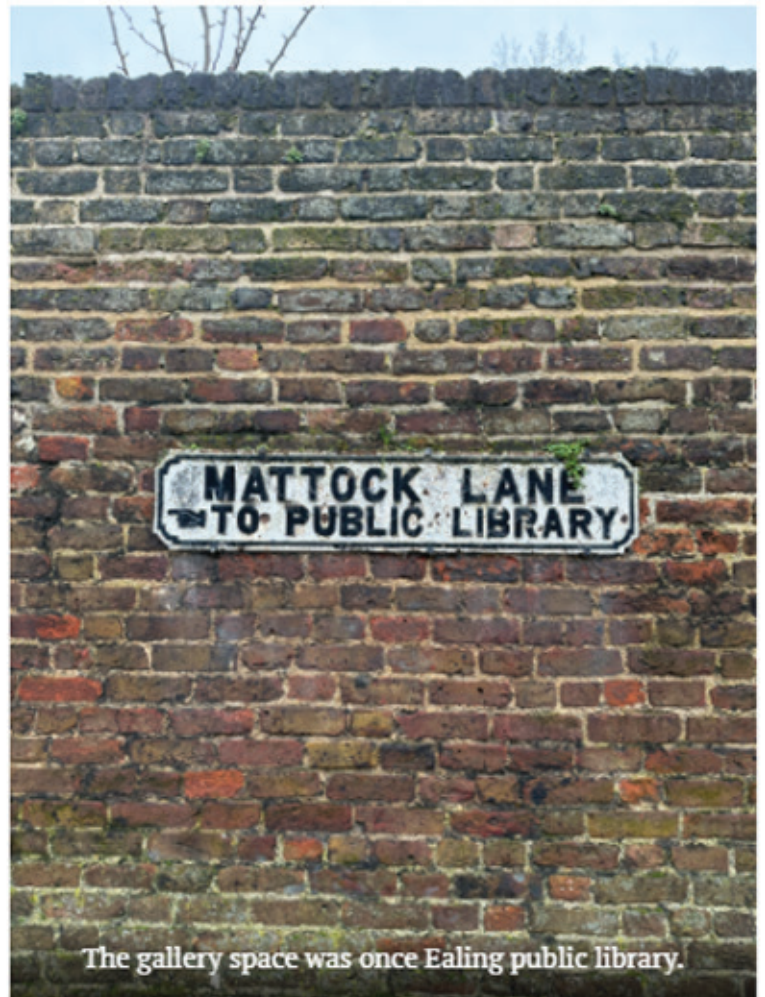
The gallery space was once Ealing public library.

I never tire of a visit to Sir John Soane's home in Ealing, I have visited Pitzhanger Manor so many times it is like returning to an old friend. I wonder how Soane felt when he left the busy streets of London behind to seek sanctuary in his suburban home.