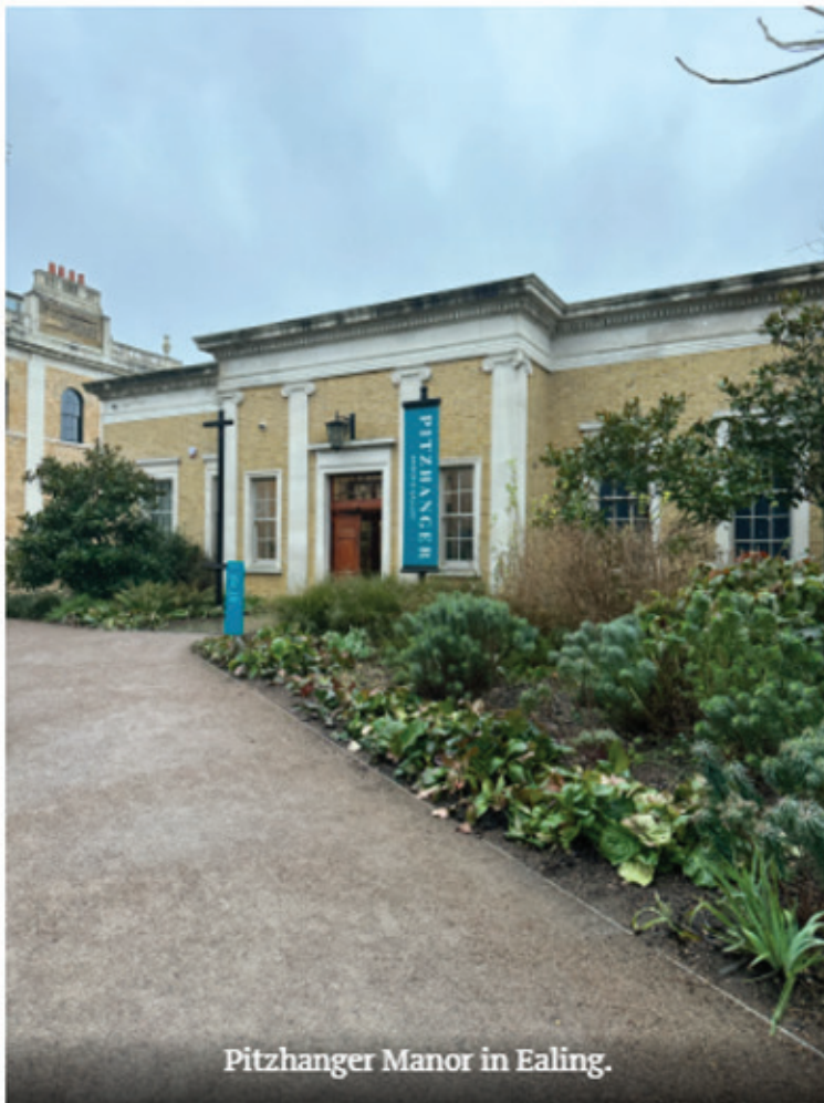
Pitzhanger Manor in Ealing.