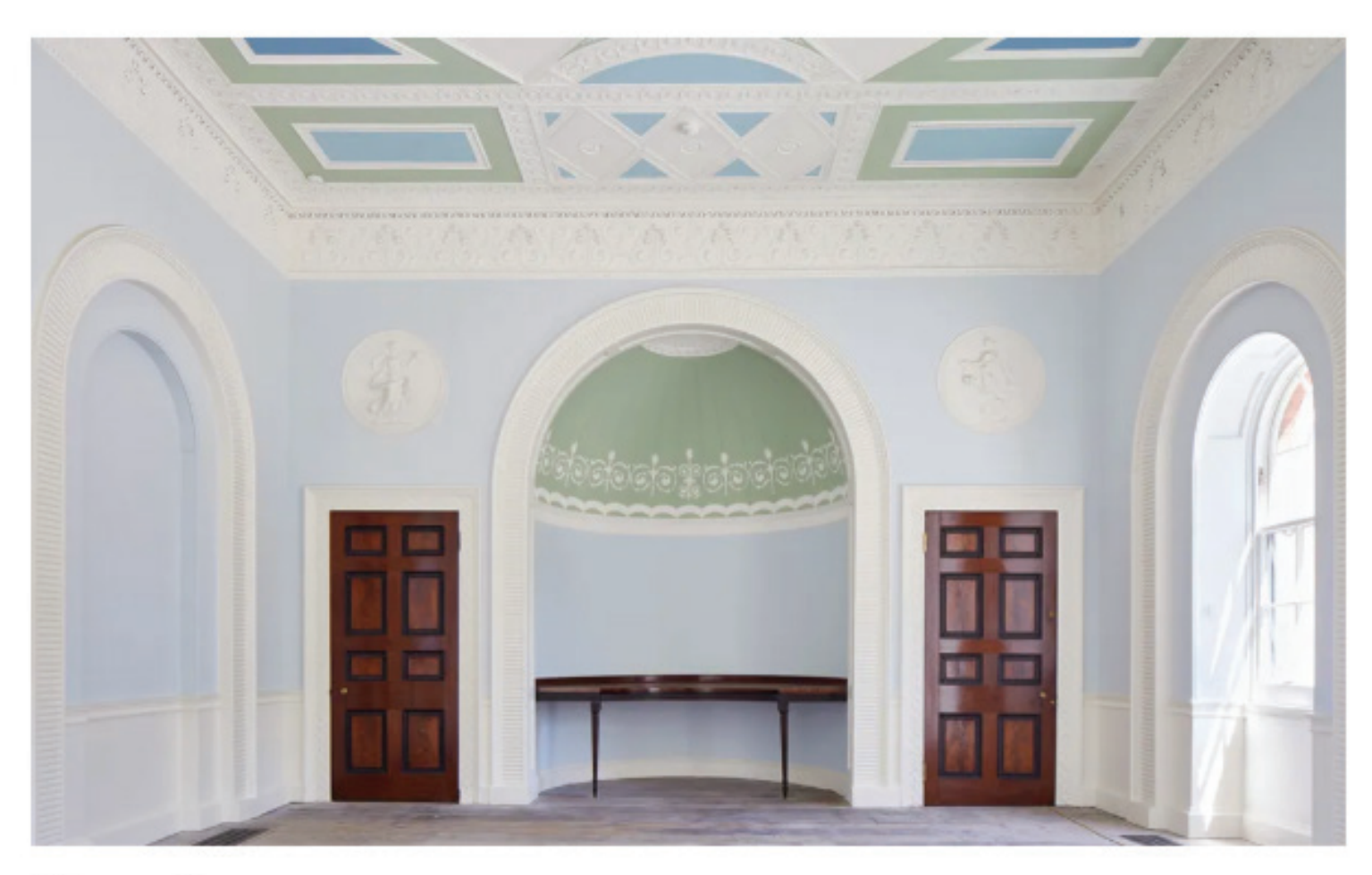
Pitzhanger Manor