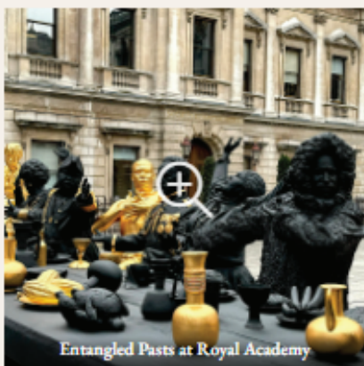
Entangled Pasts at Royal Academy

Let me tell you what I've seen already and what I'm really looking forward to from the major galleries in London right now.