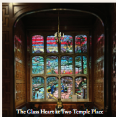
The Glass Heart at Two Temple Place