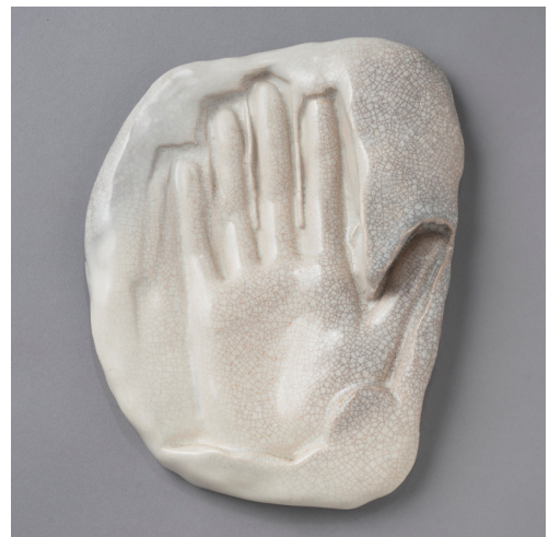
Clockwise from top left: Julie Cockburn, Boat Race 6 , 2022, Hand embroidery and self adhesive vinyl on found photograph, 18.4 cm x 10.3cm; Jennifer McRae, Angel , 2022, oil on linen paper, 18 x 13 cm; Carol Robertson, Madrigal #2 , 2022, oil on board, 12.5 x 17.8 cm; Glenys Barton, Imprint II , 2017, ceramic, 20.5 x 16 x 5 cm; Mark Duffy, Untitled No.12 (On Pugin) , photographic print, 18 x 23 cm