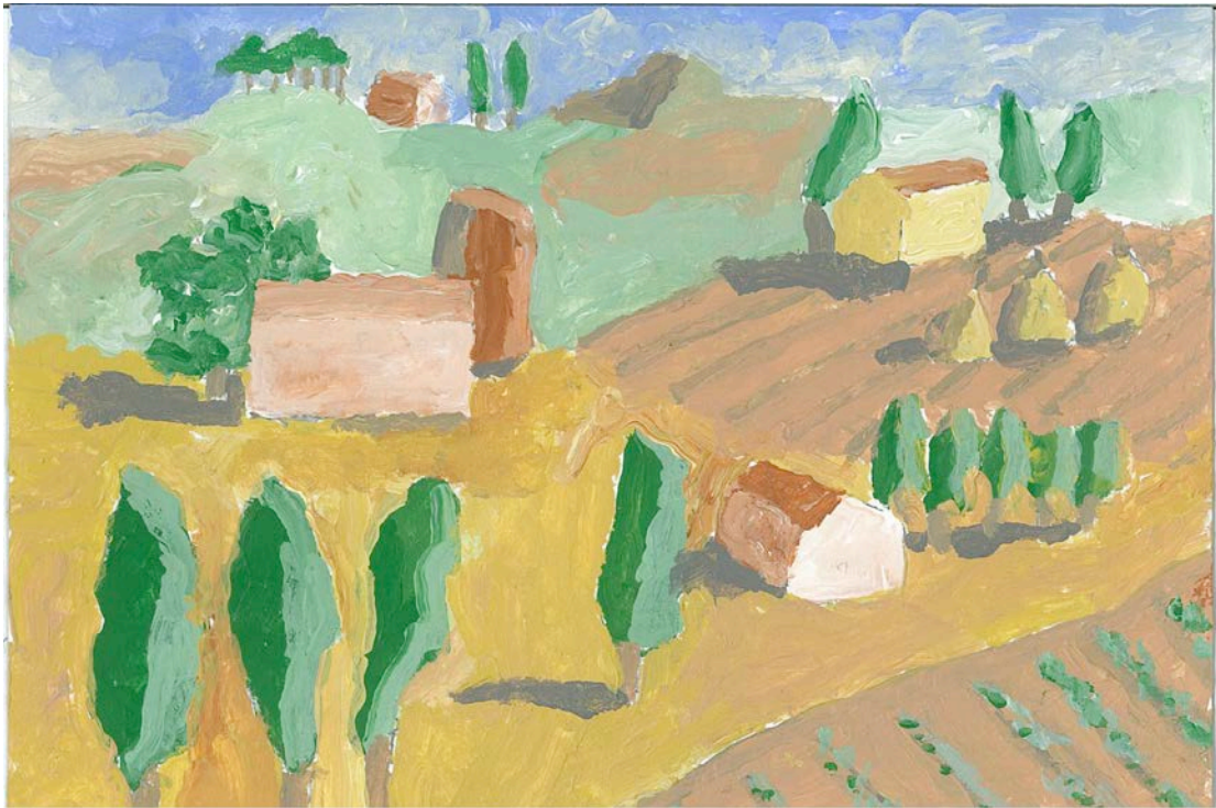
Michael Graves's postcard

One of the most notable artworks in the exhibition is by famed American architect Michael Graves, who passed away this year. This postcard was the last painting he created in his lifetime, and will be auctioned separately to the raffle, by the US-based Sir John Soane's Museum Foundation - of which he was a member of the advisory board.