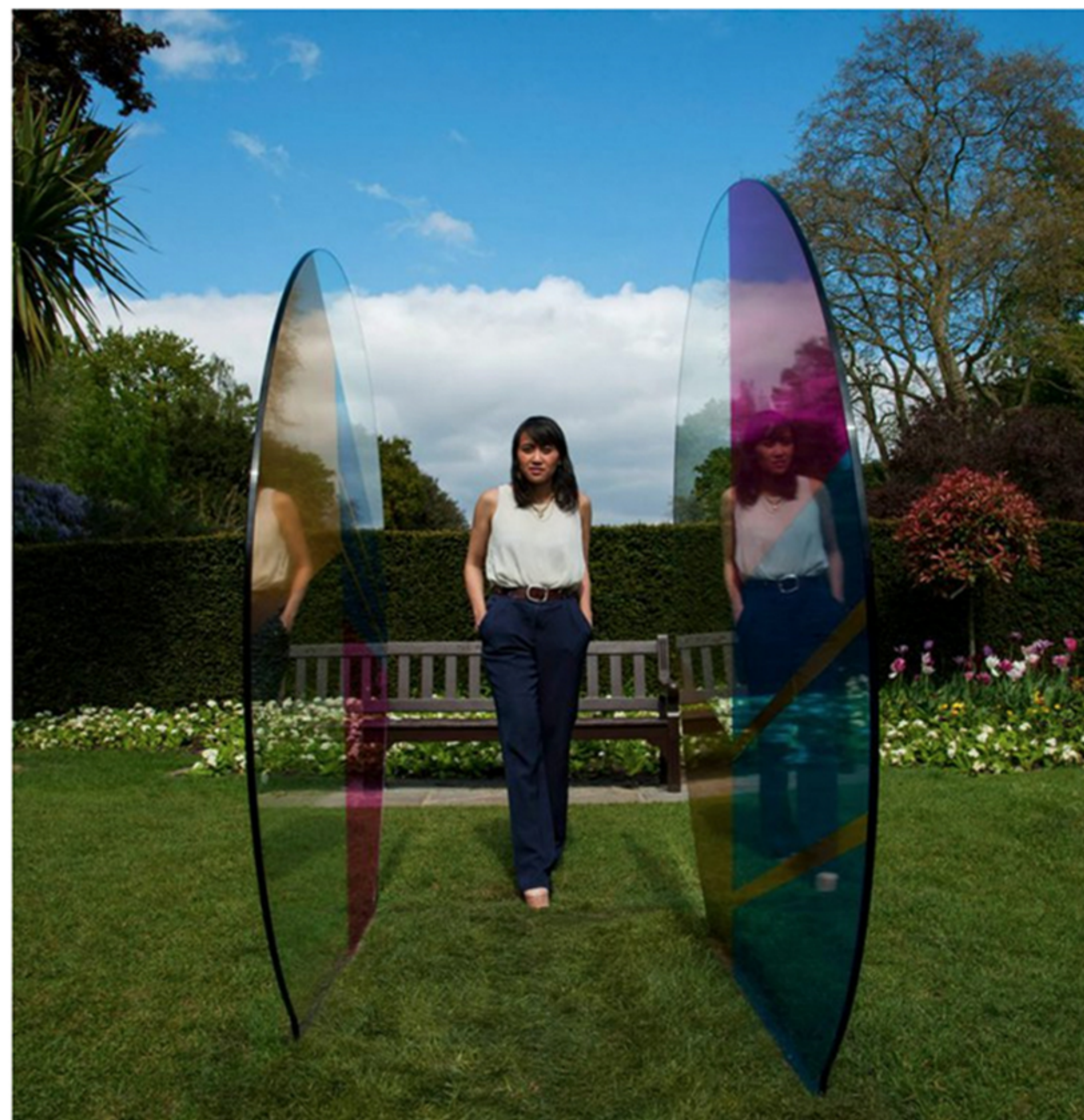
The Eccentricity of Zero , is the second commission presented through a three-year collaboration between the Royal Borough of Kensington and Chelsea and the Royal British Society of Sculptors to celebrate the work of female sculptors. Sited in Napoleon Gardens, Holland Park, London.