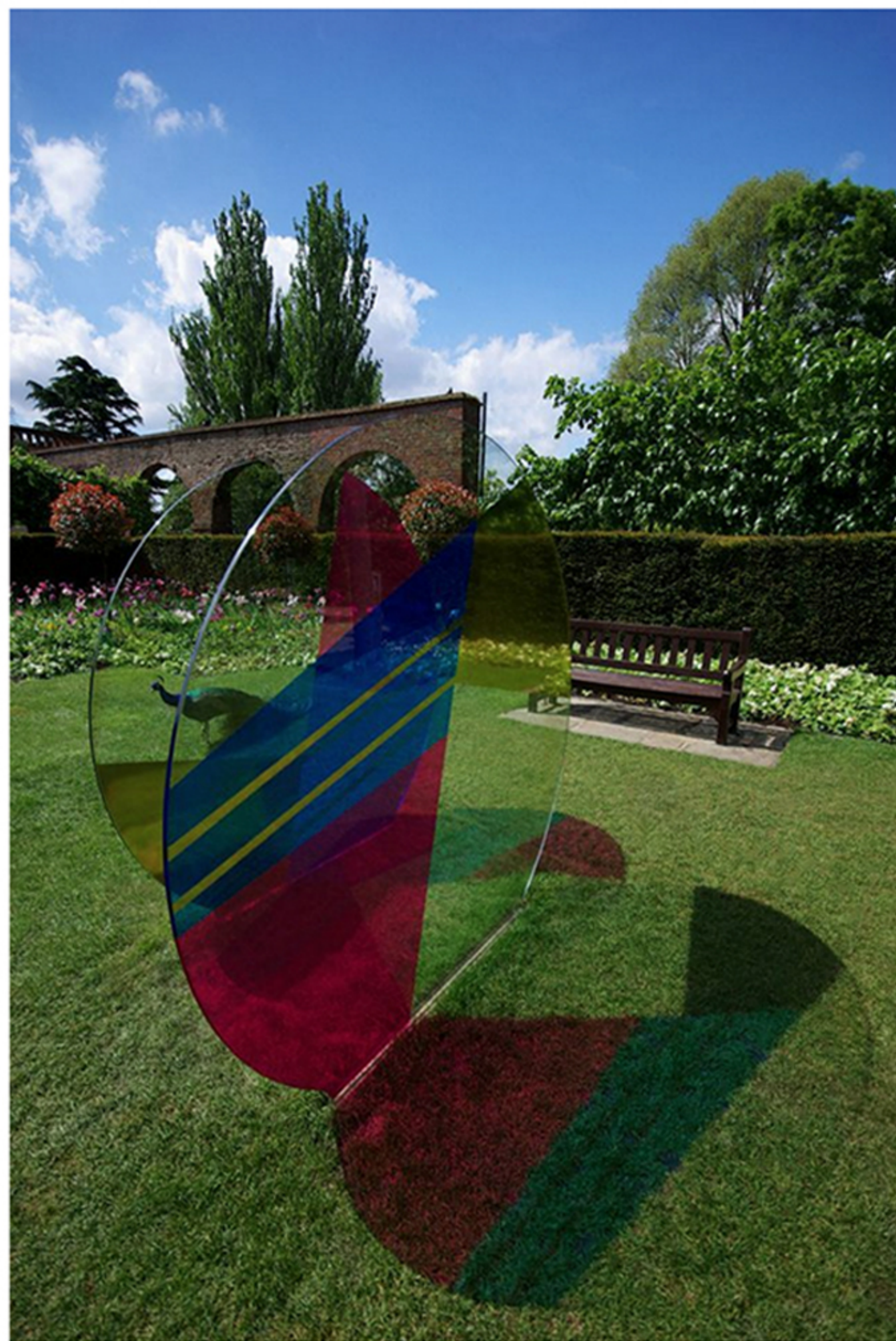
"The sculpture plays on the idea of the garden as a labyrinth, of lovers chasing each other, of veiled flirtations and words left unspoken. The round glass panels act like fluid screens where organic, human and architectural structures are contained, heightened and reflected. As sunlight passes through the geometric spreads of colour, nature and the viewer become incorporated into the work and act as catalysts to enliven it." Sinta Tantra