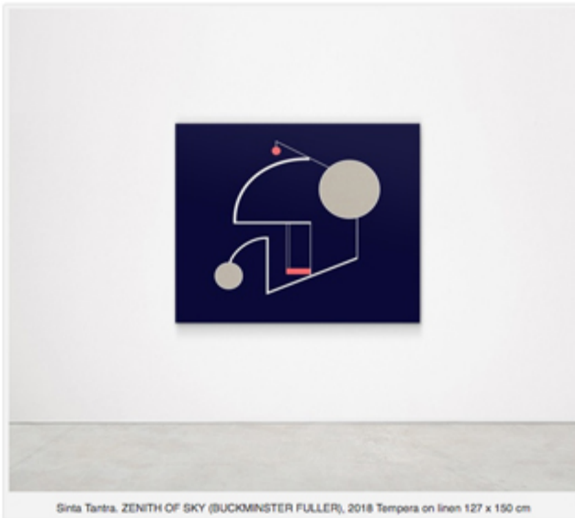
Sinta Tantra. ZENITH OF SKY (BUCKMINSTER FULLER), 2018 Tempera on linen 127 x 150 cm

"Whereas my previous works used colour to celebrate the spectacle, I recently started thinking about what would happen if colour was taken out of the equation. After studying the blueprint designs used in preparation for my public art projects, I became fascinated by line, and how at times it offered more imaginative possibilities than colour. Can total immersion be achieved through the simplicity of line alone? How does this relational experience alter the way we see and imagine?" Sinta Tantra