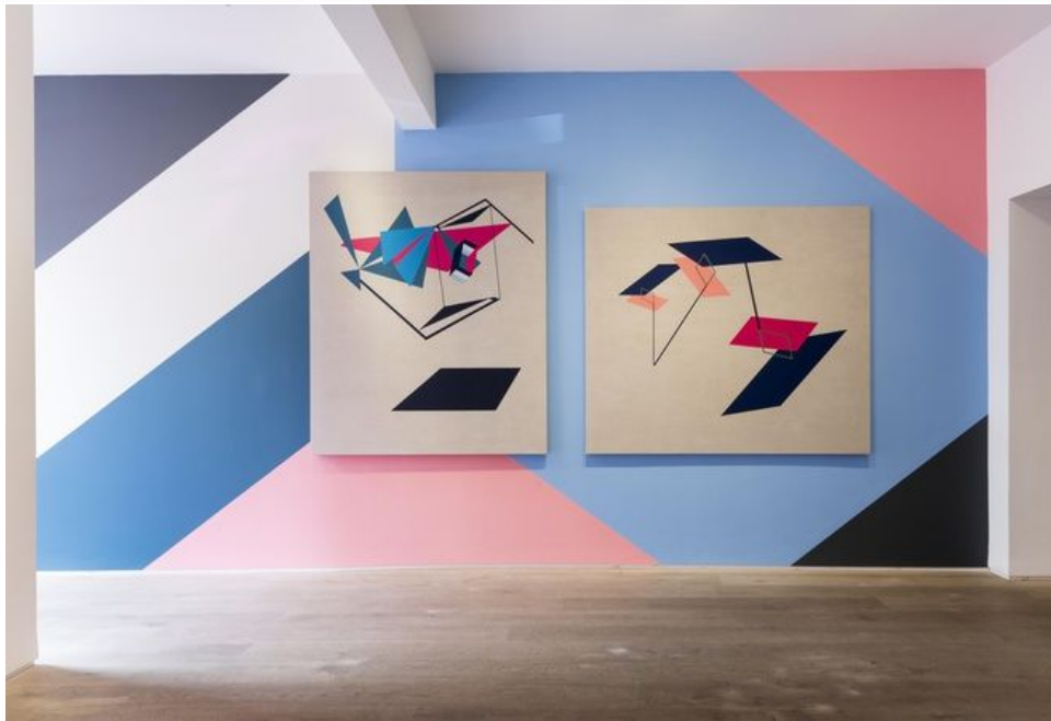
Sinta Tantra On Being Blue, A Philosophical Enquiry- Mural No.1, 2015 Paint on wall Dimensions variable Approx. 320 x 512 cm

Loyal to her signature bright colour palette, colours are taken from the petals of tropical flowers, the feathers of an exotic bird and the crest of a breaking ocean wave, yet the light natural linen on which the colours are painted softens their impact like a gritty sandy beach just after sunset. Tantra's Balinese family history is reflected through the optimism in her work, which could only come from warmer climes, and while being based in London her heritage remains a part of her. She maintains her connection with Asia, recently travelling back to complete a residency in Bali and completing a major public art commission in South Korea's Songdo.