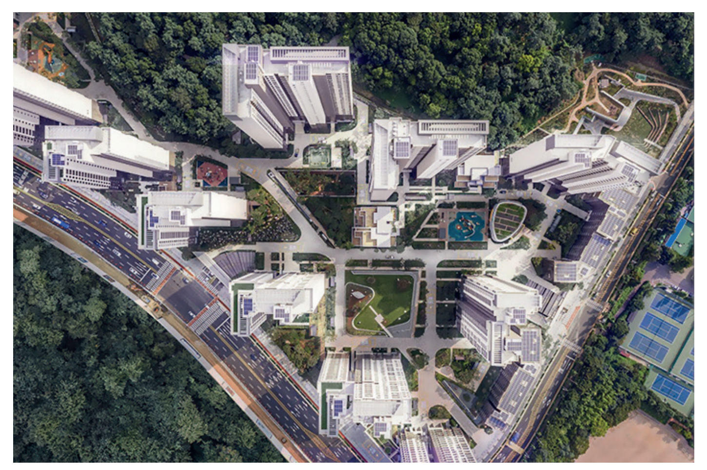
The H Honor Hills, the HDEC's first premium apartment complex in Gangnam, Seoul, was designed to harmonize with nature.

03/27/2020 Hyundai Engineering & Construction