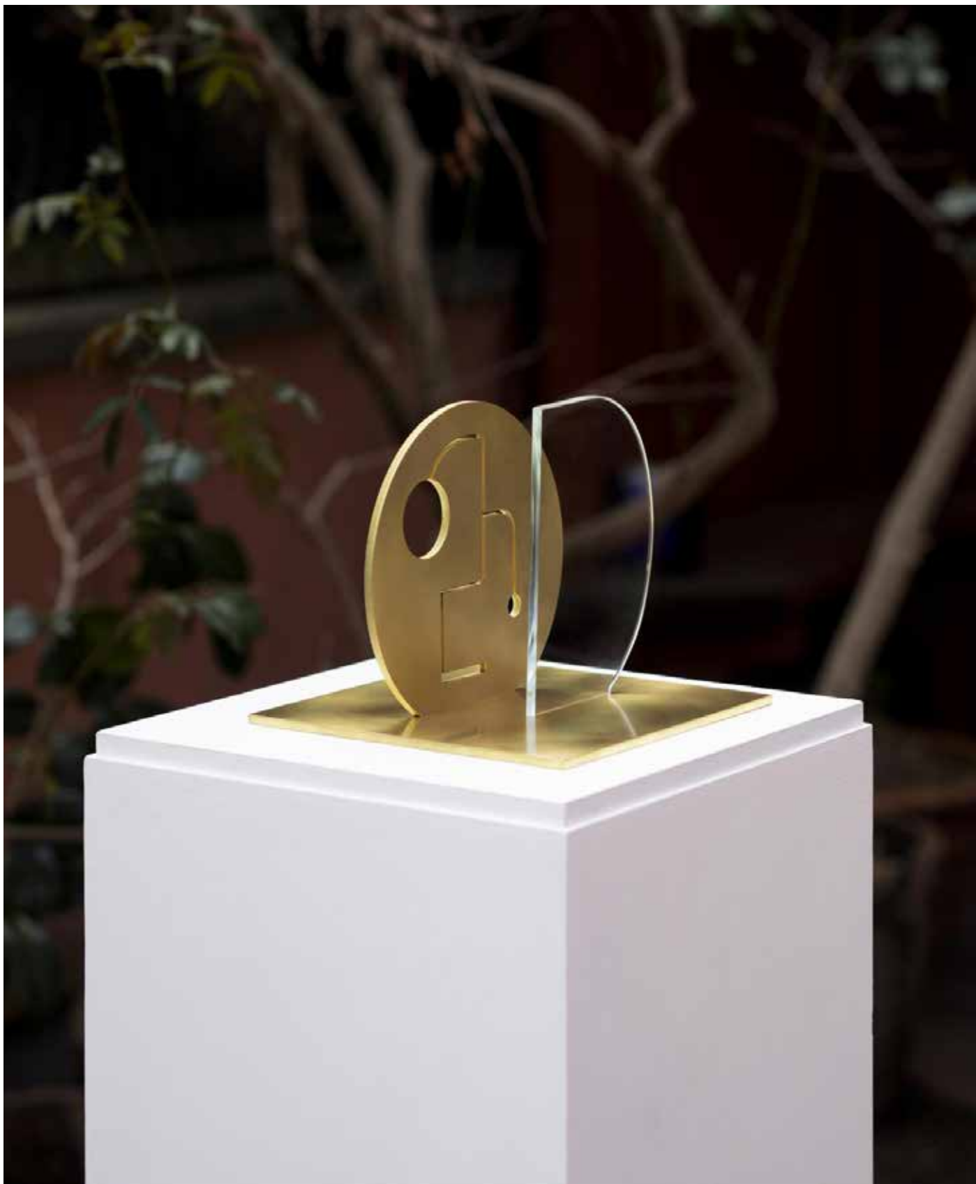
Gambin I, 2019, brass and glass