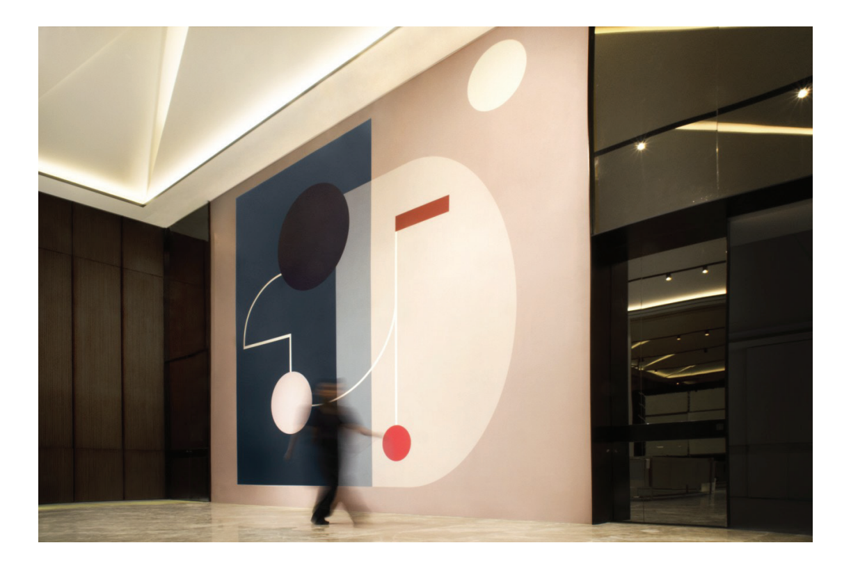
<u>Statera by Sinta Tantra at a Private Home in Jakarta ></u>

Make your space your own by injecting a collection of objects that both fizz and pop.