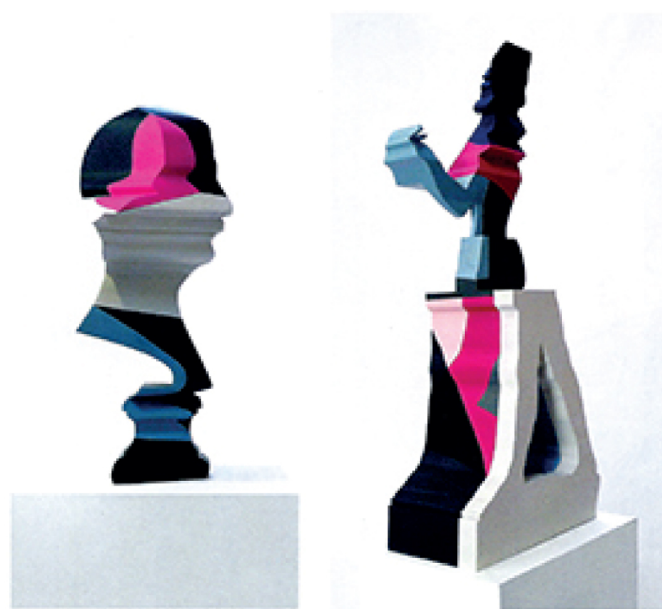
Above left: Nick Hornby & Sinta Tantra, Patron: Experiments in Color #2 , 2015, marble resin composite, paint, 60 x 27 x 35 cm. Unique. Above right: Nick Hornby & Sinta Tantra, Yes, Yes, In Chinese Blue, Hague, Cornforth, Telemagenta, Railings, Lush Pink and Drawing Room , 2015, marble resin composite, paint, 200 x 100 x 46 cm. Unique.