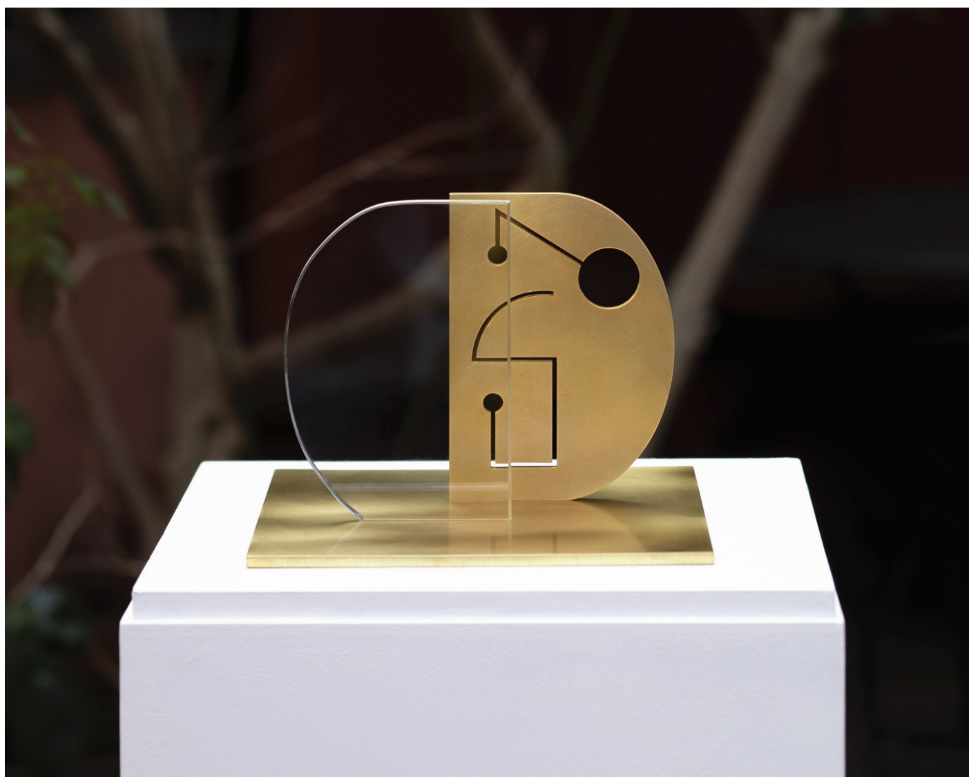
Sinta Tantra: from 'Gambin II', brass and glass, 2020, in Super Flatland

A dozen artists from Europe and Asia inhabit 'Super Flatland' at White Conduit Projects. Some are there as an artistic strategy, either for aesthetic reasons or to generate confusion between what is 2D and what 3D. Others investigate the various ways in which reality might get 'flattened' – when it goes online, for example.