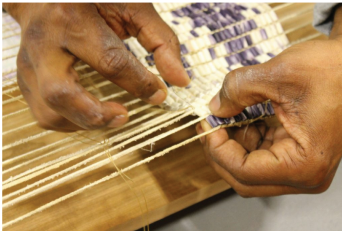
Making Wampum belts — The Box