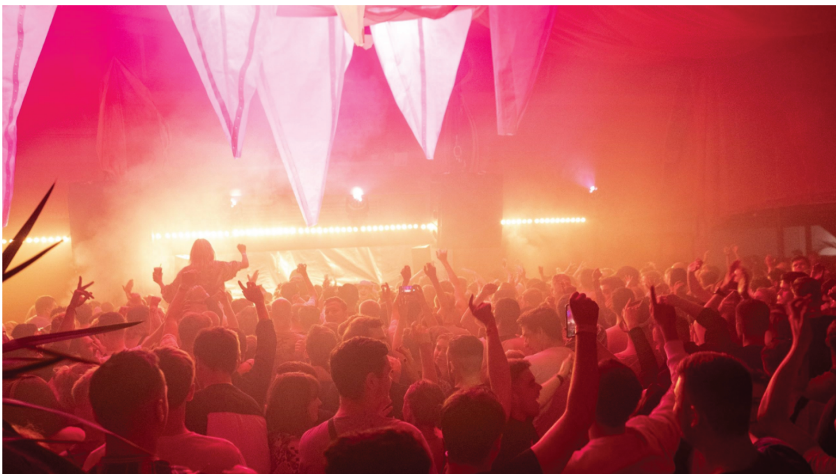
Sub Club in Glasgow is one of the nightclubs that will feature in V&A Dundee's Night Fever: Designing Club Culture exhibition — Photo by Brian Sweeney

After the longest shutdown since the second world war, museums in the UK are preparing to welcome visitors back with open (but socially distanced) arms when they are finally allowed to unlock the doors later this spring.