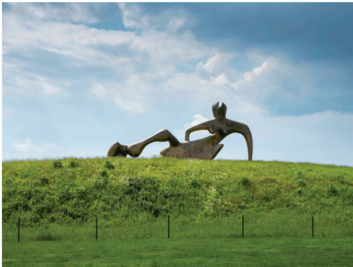
Large Reclining Figure, Henry Moore, 1984