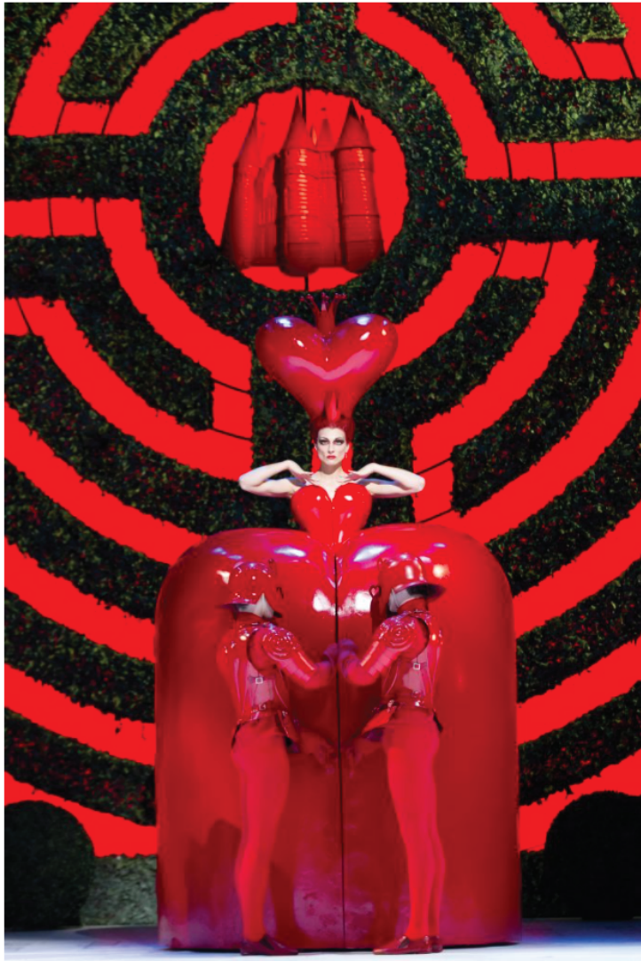
Zenaida Yanowsky as the Red Queen in the Royal Ballet production of Alice's Adventures in Wonderland, choreographed by Christopher Wheeldon, with set and costume designs by Bob Crowley