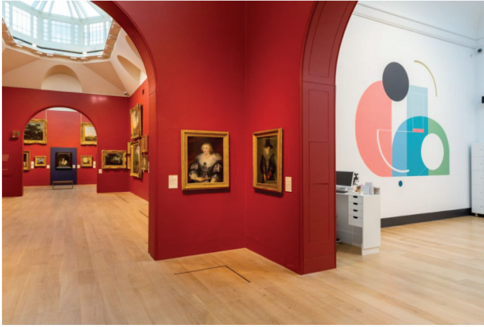
The gallery's welcome hall features new murals by Sinta Tantra