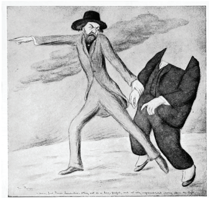
Mr. Augustus John and Lord Leverhulme, Max Beerbohm, 1921 Lithograph on paper