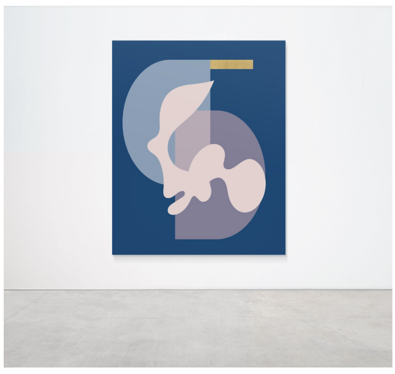
Sinta Tantra, 'A Great White God', 2022, tempera and 24ct gold leaf on linen, 160 x 130cm.