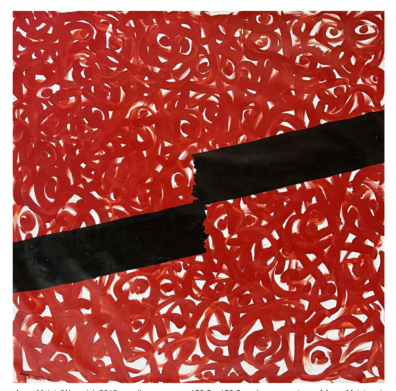
Aung Myint, 'Wrongly', 2016, acrylic on canvas, 152.5 x 152.5cm. Image courtesy of Aung Myint and Karin Weber Gallery.