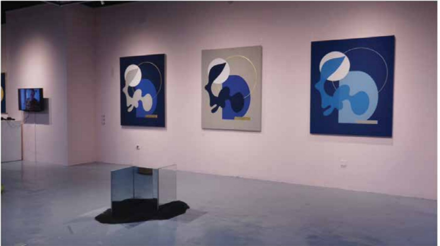
Clockwise: "Constellation of Being (1), (2), and (3)"