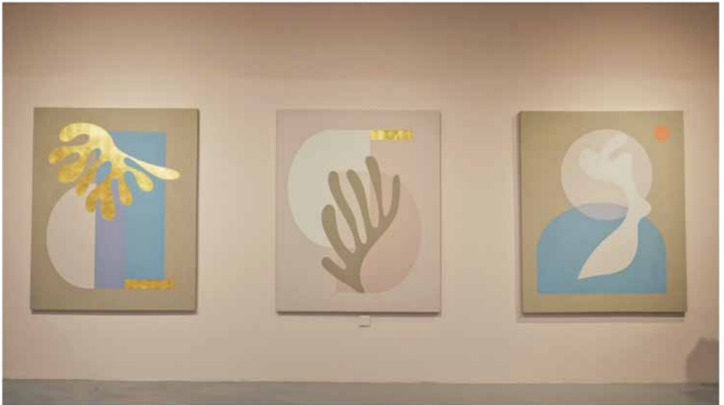
Clockwise: "Taman Ujung ( A Water Palace )," "Indah Ripon ( Black Magic )," and "Harsiam ( Broken Eggs )."