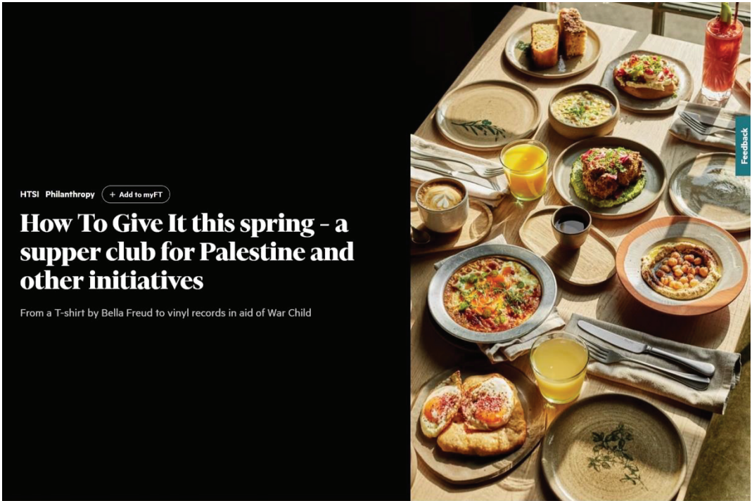
Palestinian dishes from the brunch menu at Akub in West London