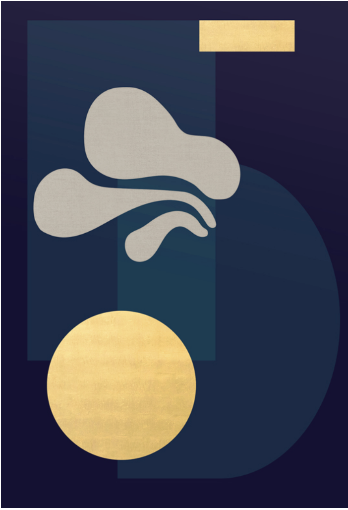
Golden Celeste, 2023, Tempera and 24ct gold leaf on linen, 120 x 80 cm