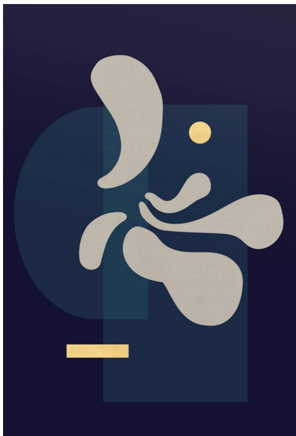
Canang Sari _ Flower Offerings, 2023, Tempera and 24ct gold leaf on linen, 120 x 80 cm

The temporal transformation of colour and form is central to all of the works on display: they are activated by the changing daylight to continually offer fresh perspectives and atmospheres. In this way, Tantra encourages us to consider how the passage of time and our cultural and physical positioning affects how we interpret images and space. All you could hear is an invitation to pause and enter into a state of deep calm and contemplation.