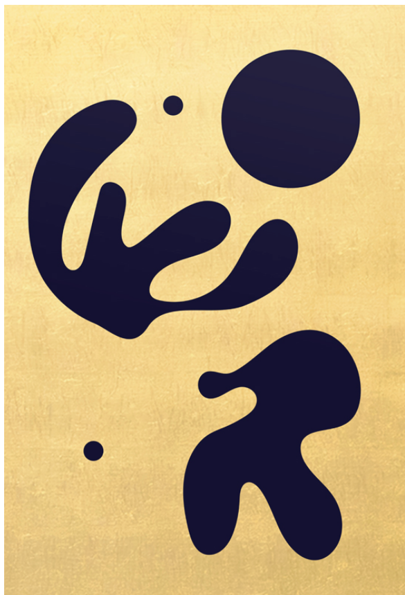
A Forgotten Kiss, 2023, Tempera and 24ct gold leaf on linen, 60 x 40 cm

The temporal transformation of colour and form is central to all of the works on display: they are activated by the changing daylight to continually offer fresh perspectives and atmospheres. In this way, Tantra encourages us to consider how the passage of time and our cultural and physical positioning affects how we interpret images and space. All you could hear is an invitation to pause and enter into a state of deep calm and contemplation.