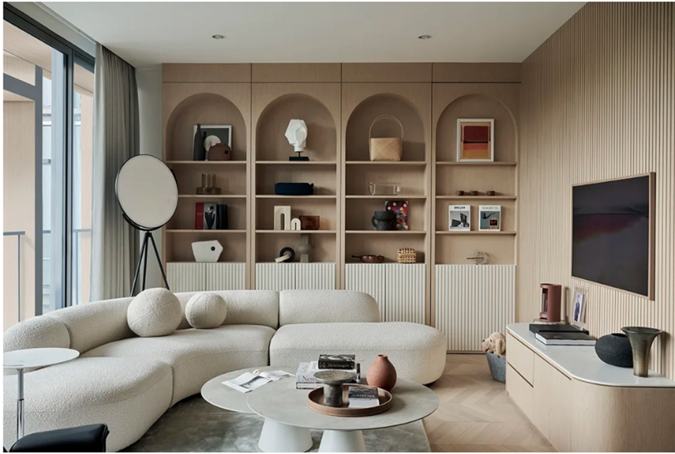
The living room area depicting Japandi style aesthetics, a mix of function & form at its best

Imagine a young family with parents in their 40's, who love to travel and collect mid-century furniture, with two children, a teenager and a six-year-old, who love to bake cookies and play Lego. The father loves classic cars and dogs, the mother collects stylish shoes and bags, and sometimes they work from home and entertain themselves with good whiskey after hours. They take delight in a neat home with understated elegance, compact with functional furniture that are easy to maintain. They are a practical family who doesn't need many decorations, but still enjoys the warmth of family visit, especially from the grandparents.