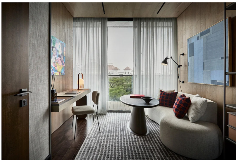
The third room, designed as a study or hobby room