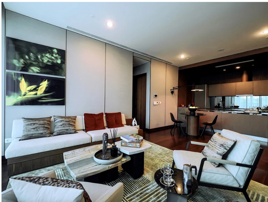
A community-focused lifestyle, realised with an open-plan living room and kitchen