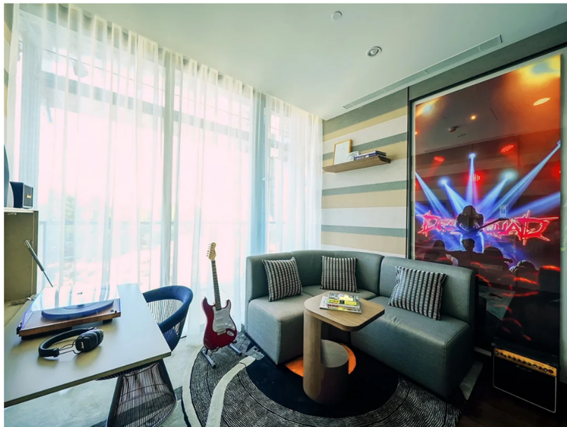
The second room design takes buyers to imagine what their room will be used for

The large open kitchen design allows the user to frequently host small gatherings, whilst still being able to separate his private space. The kitchen is furnished with a long island table with hidden storage. By putting forward communal living and promoting a sense of community, the design aimed to create a vibrant and inclusive environment that could affect positively on the well-being of the residents.