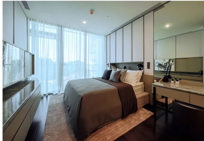
Clever storage solutions that go together with other products