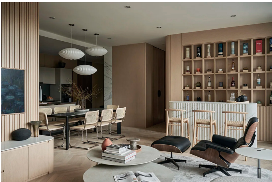
Iconic classic pieces such as Eames lounge chair & George Nelson hanging lamps adorn the common area