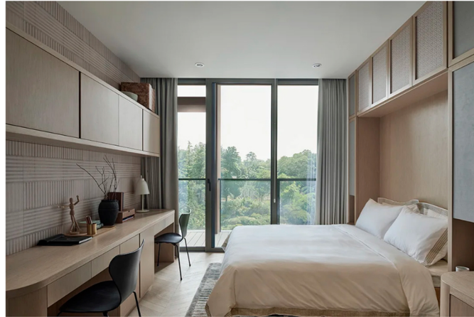
The triple function room that's compatible with the owners' lifestyle and needs