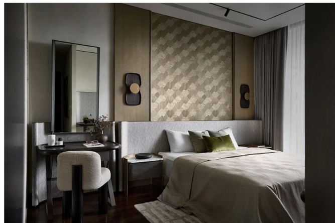
Warm and natural colours adorn the whole unit