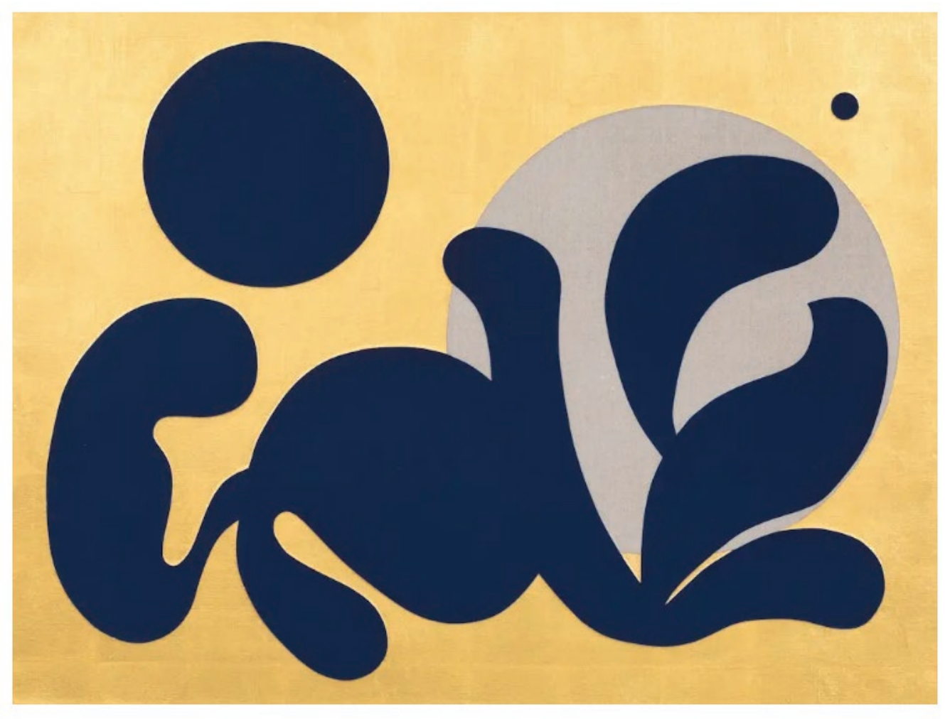
Sinta Tantra, Onyx Garden, 2024

Tantra's compositions use repetitive forms that are reimagined in different configurations as if visualising thought processes, feelings or memories. In this exhibition, almost all of the paintings appear in pairs. While the compositions themselves remain identical – blending organic and geometric shapes – the color palettes contrast: one rendered in vibrant hues of pink and purple that are traditionally associated with femininity and the other in deep shades of blue that represent a more masculine energy. We could also interpret them as representing different temporalities – day and night – different emotions or states of mind – present and introspective. By hanging the paintings alongside one another or opposite, Tantra encourages us not just to view them in dialogue, but as alternative versions of the same the whole.