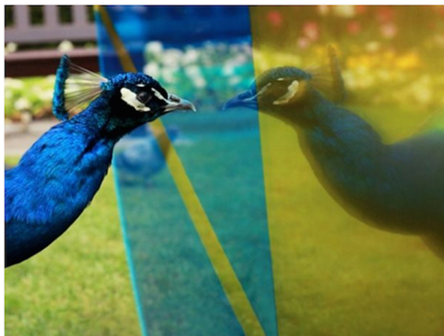
Sinta Tantra, The Eccentricity of Zero (Glass and vinyl; dimensions variable).

Viewable until 4 November 2013 at the Napoleon Garden, London.